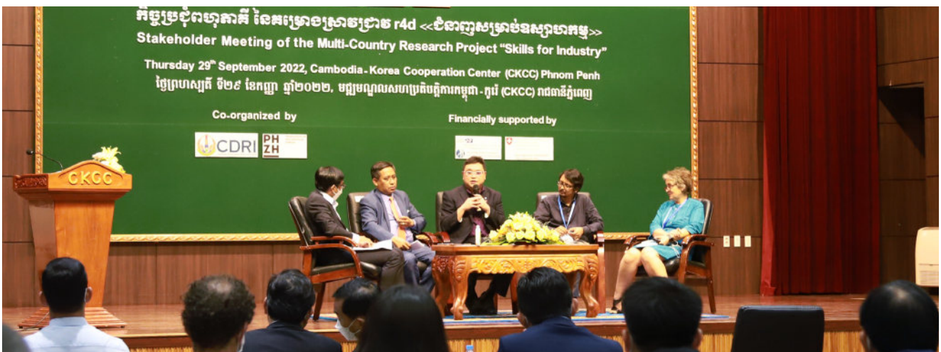
A stakeholder meeting of the multi-country research project "Skills for Industry". Phnom Penh, September 2022

Further communicating the data from this study, CDRI contributed results from Cambodia into a regional Chronic Poverty Report and organised the Poverty and Covid-19 Consultation Workshop in March 2023. Under this workshop, Covid-19 poverty dynamics and pathways to poverty reduction were an important discussion