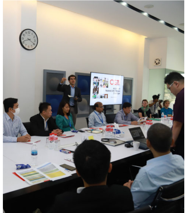
A stakeholder's site visit to the Cambodian Garment Training Institute before the meeting of the multi-country research project "Skills for Industry", Phnom Penh, September 2022

junior researchers in the centre. The training is on an on-demand basis, thus covering a wide range of topics to respond to the capacity-development needs of junior researchers.