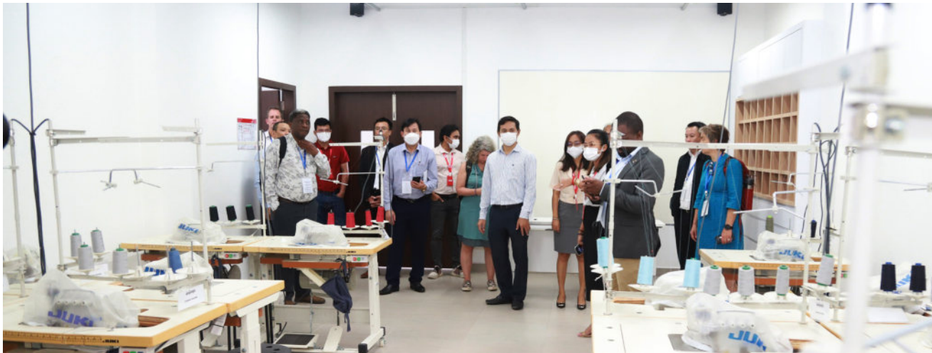
ដំណើរទស្សនកិច្ចរបស់ភាគីពាក់ព័ន្ធនៅកាន់ វិទ្យាស្ថានបណ្តុះបណ្តាលវិស័យកាត់ដេរកម្ពុជា មុនកិច្ចប្រជុំនៃគម្រោងស្រាវជ្រាវពហុប្រទេស "ជំនាញសម្រាប់ឧស្សាហកម្ម"។ រាជធានីភ្នំពេញ ខែកញ្ញា ឆ្នាំ២០២២

នៅក្នុងគម្រោង ការចូលរួមចំណែកអភិវឌ្ឍន៍ជំនាញវិជ្ជាជីវៈ សម្រាប់ការលូតលាស់ និងបរិវត្តកម្មប្រកបដោយបរិយាប័ន្នៈ ការវិភាគលើកត្តាសំខាន់ៗនៅប្រទេសកម្ពុជា (ជំនាញសម្រាប់ ឧស្សាហកម្ម) អ្នកស្រាវជ្រាវ CDRI បានកំណត់ឱ្យយល់ថា តើជំនាញមួយណា មានសារៈសំខាន់បំផុតនៅក្នុងសង្គមកម្ពុជា នាពេលបច្ចុប្បន្ន តើអ្នកតាក់តែងគោលនយោបាយ អាចកែ លម្អ ការបណ្តុះបណ្តាលជំនាញបច្ចុប្បន្នយ៉ាងណា។ នៅក្នុង ព្រឹត្តិការណ៍បំផុតនៃគម្រោងនេះគឺ ការរៀបចំកិច្ចប្រជុំពហុ ភាគី ដើម្បីបង្ហាញគម្រោងស្រាវជ្រាវ r4D ពីបណ្តាប្រទេសនានា ស្តីពី "ជំនាញសម្រាប់ឧស្សាហកម្ម" ដើម្បីពិភាក្សាអំពី គោល នយោបាយអភិវឌ្ឍន៍ជំនាញនាពេលបច្ចុប្បន្ននៅកម្ពុជា និង រំលេចលទ្ធផលស្រាវជ្រាវពាក់ព័ន្ធជាសាកល និងថ្នាក់ជាតិពី