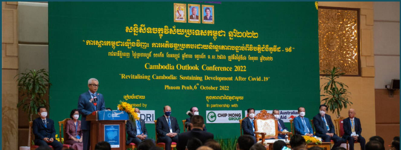
HE Dr Aun Pornmoniroth, deputy prime minister and minister of economy and finance, Royal Government of Cambodia, delivering the closing remark at the 14th Cambodia Outlook Conference. Phnom Penh, October 2022

In 2021, CDRI set out to accomplish as much of its ground-breaking research as possible, despite the rise in Covid-19 cases, stay-at-home orders and logistical challenges that continued to surface during the global emergency. To protect the health of our staff and our community, many events and research projects were significantly delayed by as much as three years. This past year has been a celebration for the institute as we were able to resume work in-person, conduct important forums and conferences, send our staff across the world to pursue personal and professional achievements and most importantly, resume the research that we are known for.