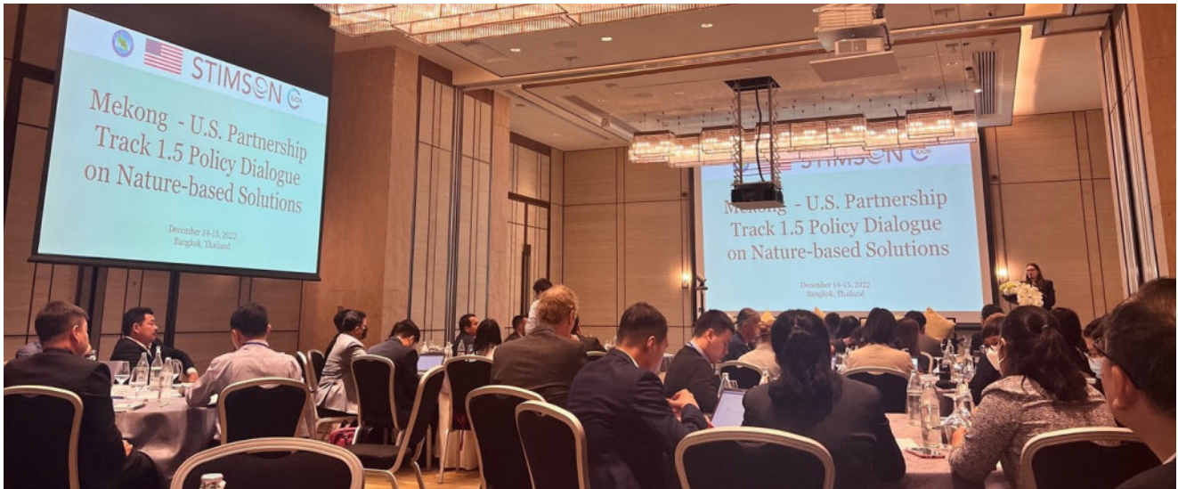
CDRI researchers participated in the Mekong-US Partnership Track 1.5 Policy Dialogue on Nature-Based Solutions, Bangkok, Thailand, December 2022

(2) nutrition-sensitive agri-food systems; (3) de-risking delta-oriented value chains; (4) inclusive, gender-equitable governance and policy for natural resources; and (5) evidence-based delta development planning. CDRI works with other partners to conduct research on Nutrition-Sensitive Deltaic Agri-Food Systems , which seeks to ensure that deltaic food systems sustain and enhance nutrition security equitably in a context of rapid change. This topic explores the linkages between food production, consumption and nutrition outcomes in delta regions, as well as the potential impacts of climate change and other drivers on these linkages.