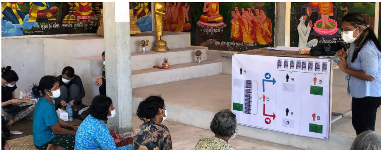
Researcher assesses the villagers' perceptions about climate change and gender for the project Renewable Energy and Climate Change Perceptions in Cambodia. Kompong Chhnang, March 2022

Nations Institute for Training and Research, CDRI is conducting a scoping study to examine policies and strategies for an inclusive green economy. With the United Nations Environment Programme and Climate Analytics, we are developing a research proposal entitled: "Towards Zero Carbon Asia - Transformational Shift from Fossil Fuel-Based to Sustainable Development Pathways." The proposal will be submitted to the Federal Ministry for the Environment, Nature Conservation, and Nuclear Safety (BMU) of Germany for funding support. These studies will provide policy options for ensuring that Cambodia will achieve its target of inclusively and equitably becoming a high-income green economy with carbon neutrality by 2050.