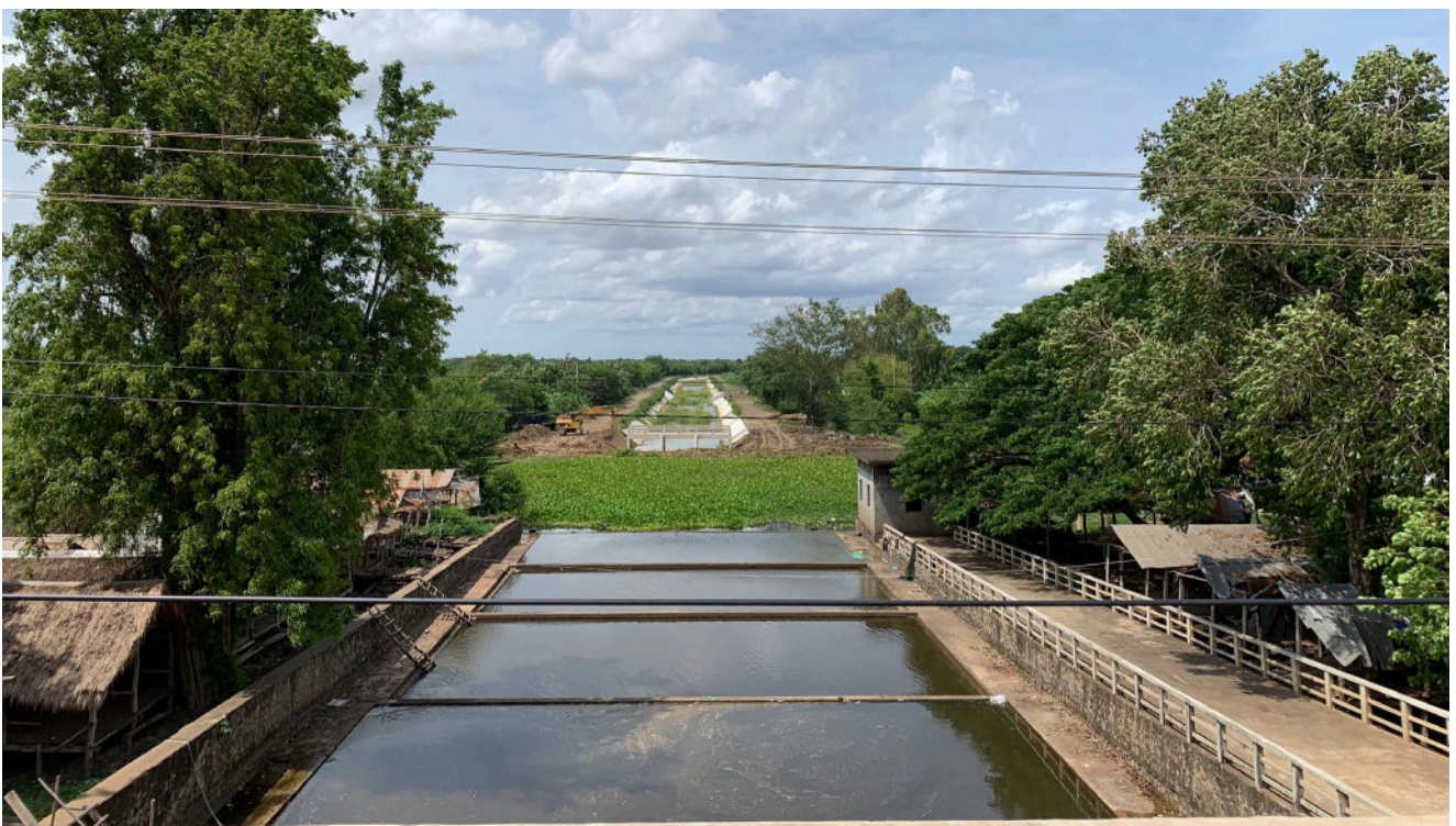
Researcher identifies water shortages at the local level to provide strategies and pathways in connection to water-land governance. Battambang, May 2022

Regarding the institute's major theme, Climate Change and Migration: Evidence from Mekong Lowland Cambodia was a timely and important study that CGIS undertook, which finished in October 2022. Understanding the connections between climate change and migration, specifically, migratory patterns, extreme weather occurrences and current trends in climate change, is crucial. In addition, it is necessary to understand local residents' views of environmental deterioration and harsh weather, as well as how such perceptions may affect their livelihoods and migratory patterns. Working with the Centre for Natural Resources and Environment, CGIS is also co-researching a project titled Asian Mega Deltas (AMD) Working Package 4 and Resilient Aquatic Foods in Food, Land and Water Systems (RAqFS) Working Package 3- Sand Dam Performance Assessment , which ended in February 2023. Two research teams identified significant shortages at the national to local level to provide strategies on water-land governance.