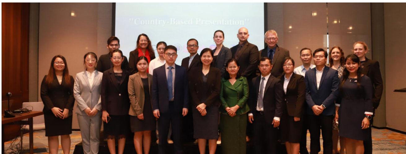
CDRI hosted a Policy Dialogue on Water Diplomacy of the Mekong Basin: Toward a Shared Basin for Prosperity. Phnom Penh, February 2023