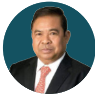
HE Dr Chea Chanto Honorary chair Governor of the National Bank of Cambodia