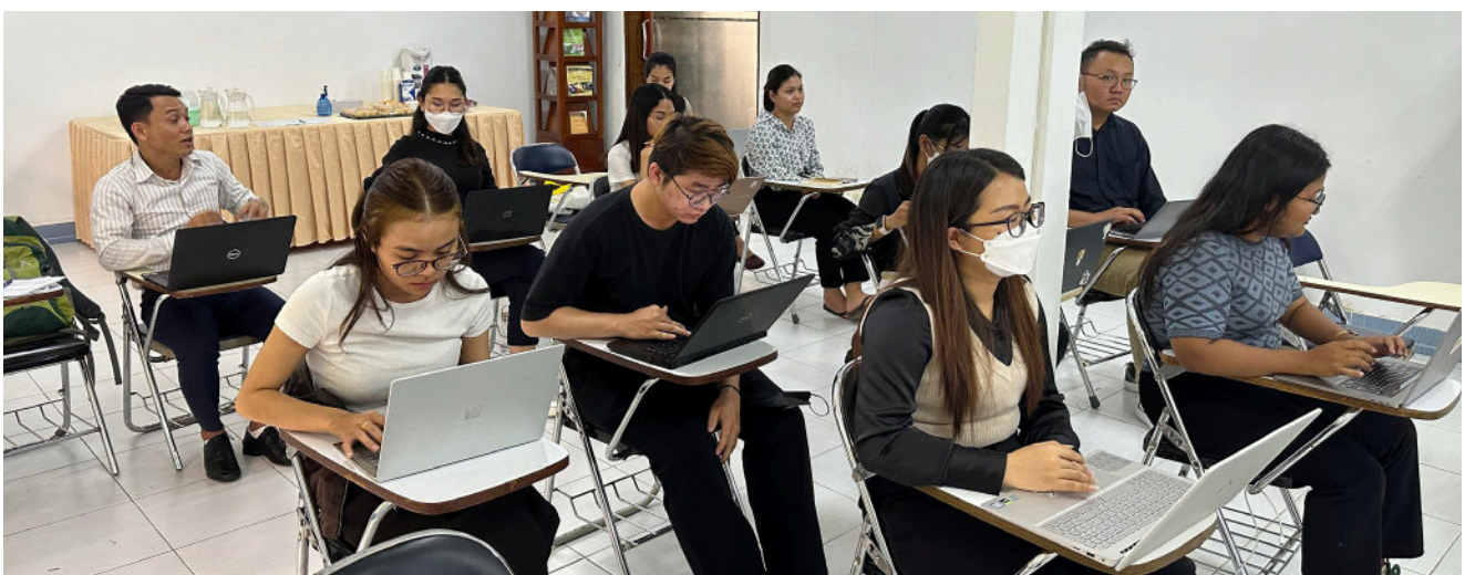
CDRI held an internal training and mentoring programme on applied research methods to help researchers and junior researchers, to enhance their abilities in formulating quantitative research questions, developing research designs addressing questions, conducting data analysis and interpretation using STATA and writing their papers. Phnom Penh, March 2023

With such a full year of new and exciting accomplishments, CDRI excitedly looks forward to 2023 and strengthening existing partnerships and research networks, conducting further phases of impactful research and guiding Cambodia's policymakers into sustainable and equitable decisions for the country's future.