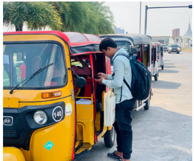
CNRE researchers survey the consumption of liquified petroleum gas in residential, commercial, road transport and industrial sectors. Phnom Penh, February 2023

Finally, CNRE has become a member of Mekong Think Tanks, a regional consortium that seeks to refine the role and effectiveness of national and regional knowledge-based policy influencing organisations (KBPIOs) in engaging with national and regional policy processes on water and energy security as well as climate change mitigation and adaptation. We also focus on inclusive knowledge co-production processes, capacity for networking of national and regional KBPIOs, capacity of young professionals in delivering research and communicating and engaging with policy processes.