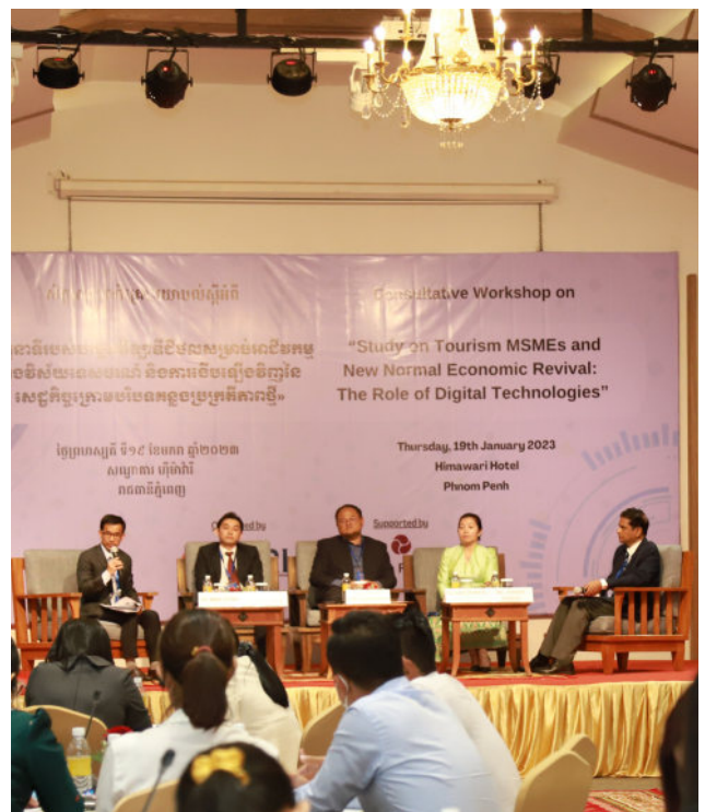
A consultative workshop for Study on Tourism MSME and 'New Normal' Economic Revival: The Role of Digital Technologies. Phnom Penh, January 2023