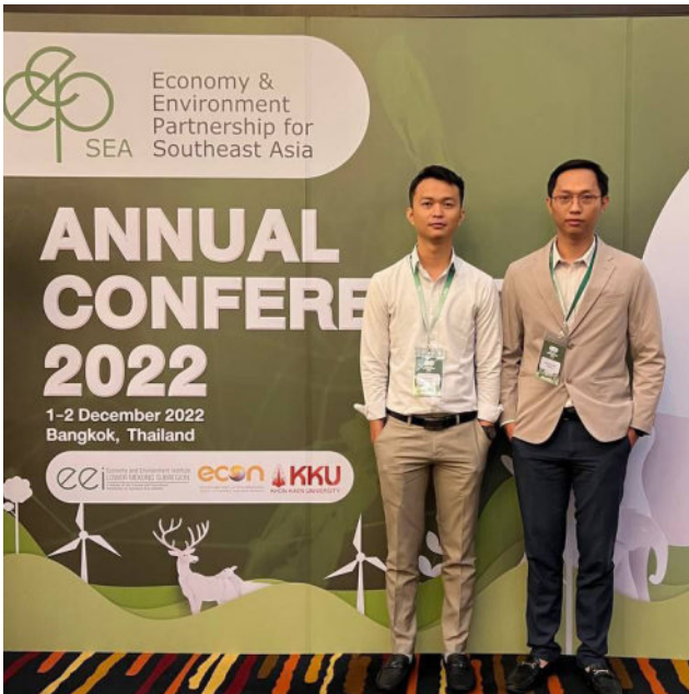
អ្នកស្រាវជ្រាវ CDRI ចូលរួមសន្និសីទប្រចាំឆ្នាំស្តីពីភាពជាដៃគូសេដ្ឋកិច្ច និងបរិស្ថានសម្រាប់អាស៊ីអាគ្នេយ៍។ ប្រទេសថៃ ខែធ្នូ ឆ្នាំ២០២២ CDRI researchers participated in the Economy and Environment Partnership for Southeast Asia Annual Conference. Thailand, December 2022

ដែលអាចនឹងទទួលបានអត្ថប្រយោជន៍ពី កម្មវិធីអន្តរាគមន៍ ភាគច្រើនកង្វះកម្លាំងពលកម្មក្នុងគ្រួសារ សម្រាប់មនុស្សចាស់ អាកាសធាតុក្តៅខ្លាំង ការប្តេជ្ញាចិត្តធ្លាក់ចុះពីគ្រួសារក្រីក្រ និង កង្វះជំនួយផ្នែកហិរញ្ញវត្ថុ និងបច្ចេកទេស។ នៅក្នុងអត្ថបទ H2Open វិទ្យាស្ថាន CDRI បានបង្ហាញពីរបៀបដែលកម្មវិធី មិនមានលក្ខណៈបង្គាប់បញ្ជា ដោយប្រើប្រាស់អ្នកដឹកនាំនៅ មូលដ្ឋាន អាចរួមចំណែក ដោះស្រាយបញ្ហាប្រឈមផ្នែក អនាម័យបាន។