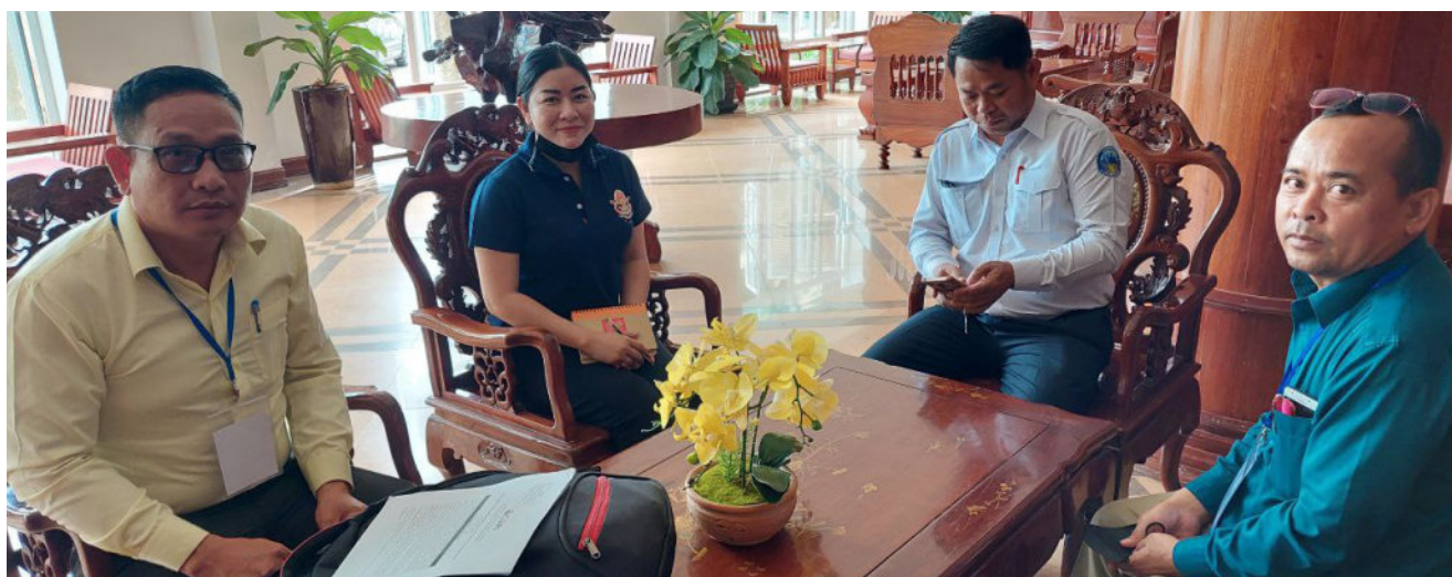
CDRI researchers interviewed over 300 firms of varying sizes, as well as ministries and business associations, to understand what factors both catalysed and inhibited growth in the private sector under a project titled Strengthening Cambodia's Post-Pandemic Recovery and Competitiveness Pathways. Phnom Penh, August 2022

In supporting Cambodia to move toward carbon neutrality and an inclusive green economy, CDRI has been implementing a number of studies. We have completed a study gauging public perceptions of renewable energy and climate change, which provided significant insight into public attitudes toward renewable energy and its benefits. In addition, working with the United