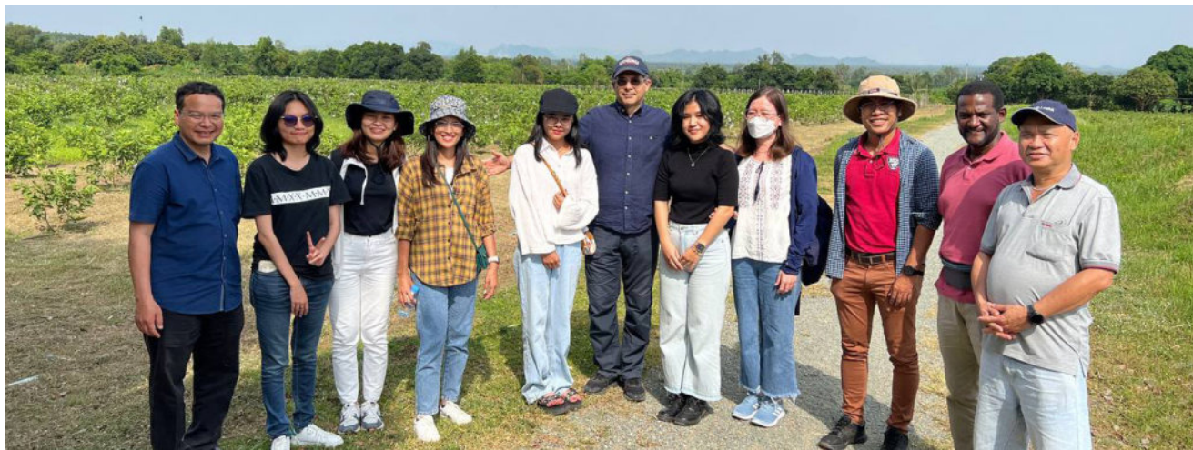
Field study of a joint regional research on the Agricultural Development Policy Assessment in selected Mekong Sub-region countries, Kep, November 2022