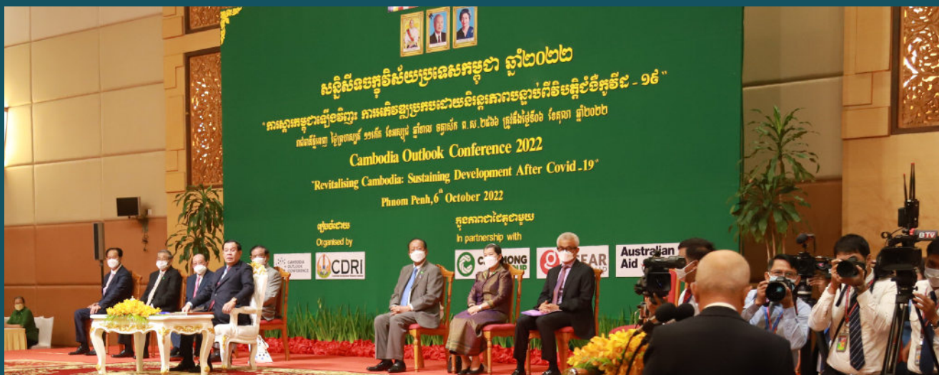
សម្តេចអគ្គមហាសេនាបតីតេជោ ហ៊ុន សែន នាយករដ្ឋមន្ត្រី នៃព្រះរាជាណាចក្រកម្ពុជា ថ្លែងសូន្យកថាគន្លឹះបើកអង្គសន្និសីទ និងប្រសាសន៍ សំណេះសំណាលដ៏ខ្ពស់ខ្ពស់ នៅក្នុងសន្និសីទចក្រវិស័យប្រទេសកម្ពុជាឆ្នាំ២០២២ លើកទី១៤ បន្ទាប់ពីការខកខានរៀបចំពីរឆ្នាំ គឺឆ្នាំ២០២០ និង២០២១ ដោយសារការផ្ទុះឆ្លងរាលដាលជំងឺកូវីដ-១៩។ ភ្នំពេញ ខែតុលា ឆ្នាំ២០២២

Samdech Akka Moha Sena Padei Techo Hun Sen, Prime Minister of the Kingdom of Cambodia, delivering the keynote address at the 14th Cambodia Outlook Conference after two years of delay in 2020 and 2021 due to the spread of Covid-19. Phnom Penh, October 2022