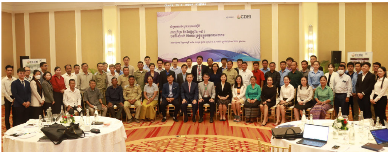
អ្នកចូលរួមនៅក្នុងសិក្ខាសាលាពិគ្រោះយោបល់ស្តីពីភាពក្រីក្រ និងវិបត្តិកូវីដ-១៩៖ បទពិសោធន៍ និងការត្រៀមខ្លួននាពេលអនាគត។ ភ្នំពេញ ខែមីនា ឆ្នាំ២០២៣

នៅក្នុងការផ្តោតលើគោលបំណង ដើម្បីកាត់បន្ថយភាពក្រីក្រ វិទ្យាស្ថាន CDRI បានអង្កេតផលប៉ះពាល់ពីភាពក្រីក្រ រ៉ាំរ៉ៃ ដែលជាលទ្ធផលនៃជំងឺរាតត្បាត។ នៅក្នុងដំណាក់កាលដំបូងនៃការសិក្សាអំពី ភាពក្រីក្រដោយសារកូវីដ-១៩ ដែលត្រូវបានផ្តួចផ្តើមឡើងកាលពីឆ្នាំ២០២១ វិទ្យាស្ថាន CDRI និងបណ្តាញប្រឹក្សាពិភាពក្រីក្ររ៉ាំរ៉ៃ (CPAN) បានសរសេររបាយការណ៍ជាតិមួយមានចំណងជើងថា ឌីណាមិកនៃភាពក្រីក្រ និងកូវីដ-១៩ នៅកម្ពុជា ដែលសំយោគការវិភាគបែបបរិមាណវិស័យនៃ ទិន្នន័យអង្កេតត្រួសារមុនការរាតត្បាតនៅភ្នំពេញ ខេត្តកំពង់ធំ និងខេត្តព្រៃវែង ដើម្បីវាយតម្លៃផលប៉ះពាល់សេដ្ឋកិច្ចសង្គមនៃជំងឺរាតត្បាត។ ដើម្បីចែករំលែកលទ្ធផលស្រាវជ្រាវសំខាន់ៗអំពីភាពក្រីក្រ ការធ្វើចំណាកស្រុក និងការគាំពារសង្គម CDRI បានរៀបចំសិក្ខាសាលាមួយ នៅខេត្តបាត់ដំបង ដើម្បីឱ្យអ្នកគ្រប់គ្រងមូលដ្ឋាន បានជួបពិភាក្សាជាមួយតំណាងក្រសួងថ្នាក់ជាតិស្តីពីអន្តរាគមន៍ភាពក្រីក្រ និងការធ្វើចំណាកស្រុកនៅចុងខែធ្នូ។ តាមរយៈសិក្ខាសាលាផ្សព្វផ្សាយនេះ អ្នកចូលរួមពហុភាគី បានចែករំលែកយុទ្ធសាស្ត្រអភិវឌ្ឍន៍ក្នុងការគាំពារសង្គម និងការគ្រប់គ្រងហានិភ័យសម្រាប់ពលរដ្ឋងាយរងគ្រោះបំផុតរបស់ប្រទេសជាតិ។ អ្នកចូលរួមមានភាពចម្រុះខាងបទពិសោធន៍ ប្រវត្តិការងារ និង