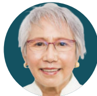
Dr Seet Ai Mee Former Minister of Education of Singapore, AML Sci-Ed Consultants Pte Ltd