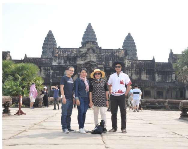
HR and admin team

research centres has helped improve compliance with project implementation schedules and progress reporting.