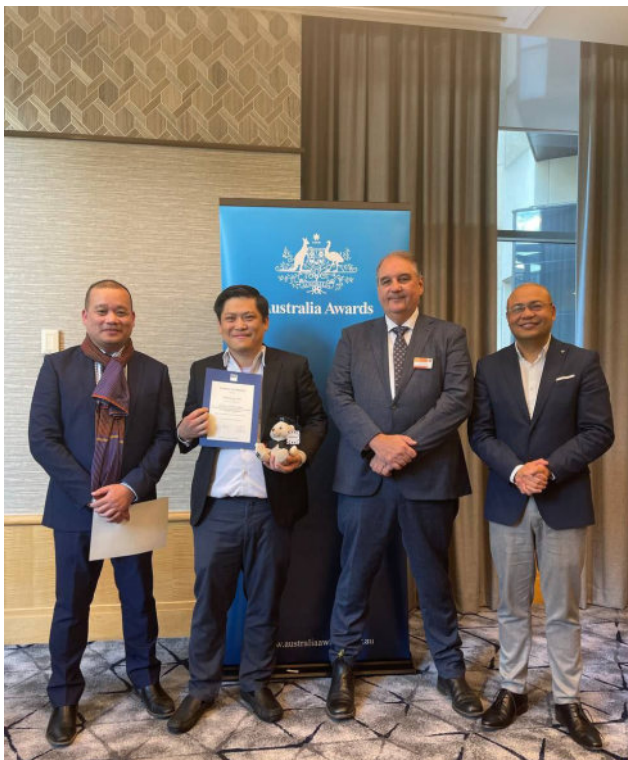
A research fellow and director from CPARD participated in a capacity development training on attracting and managing FDI in Post-Covid 19 under Australia awards. Australia, May 2022

To help boost research capacity and administrative support, eighteen qualified researchers and operations staff were recruited last year. This is in addition to 25 international and Cambodian visiting fellows, advisors, consultants and interns who joined CDRI to gain research experience. CDRI offers study leave to support young researchers in the pursuit of academic studies and professional training both in Cambodia and abroad, which benefitted two researchers who will study overseas on scholarships. In 2022, one senior researcher will study a doctoral programme in Japan, and another junior researcher was admitted to a graduate degree programme in Australia.