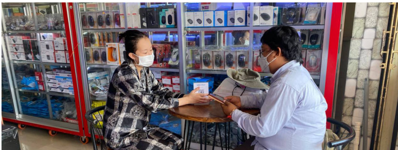
A survey on taxation to understand taxpayers' knowledge, perceptions, behaviours and willingness to pay taxes in accord with the current tax policy and services. Phnom Penh, August 2022