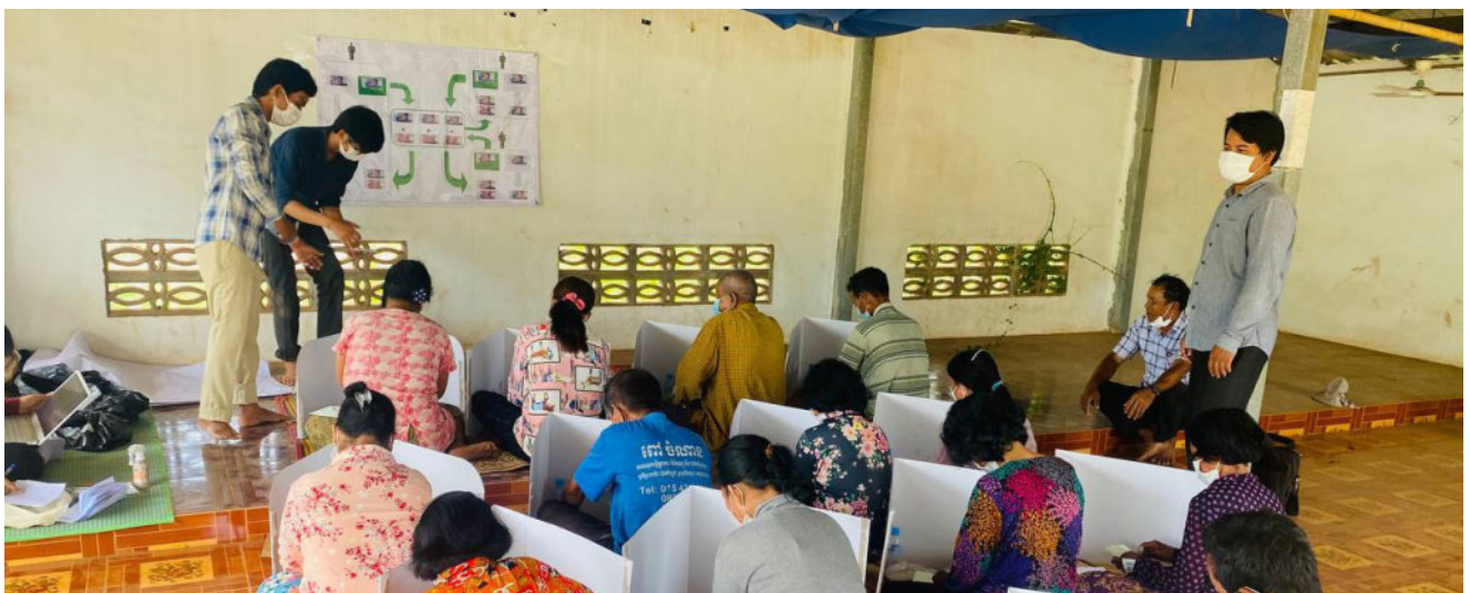
Women villagers listening to CDRI researchers explanation on Renewable Energy and Climate Change Perceptions in Cambodia. Kompong Chhnang, March 2022