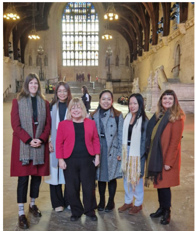
CDRI researcher attended a knowledge exchange for a two-project research collaboration in the United Kingdom under the UK Global Challenges Research Fund and Newton Fund, November 2022