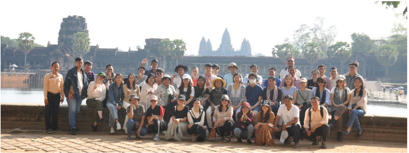
CDRI staff retreat in Siem Reap, January 2023