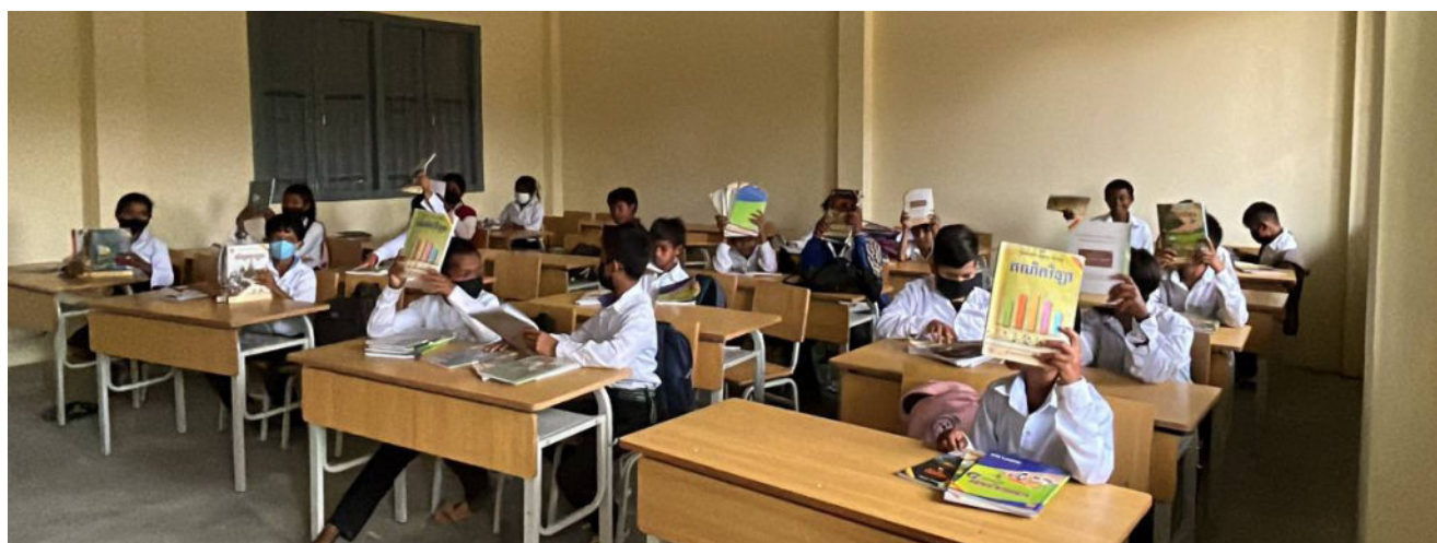
A CDRI study under Learning to Improve Book Resource Operational Systems (LIBROS) seeks to diagnose improvements to primary-level text and children's book supply chains and find transferable lessons for other contexts. A primary school's classroom in Banteay Meanchey, January 2023

In countries with budding publishing industries like Cambodia, the distribution of children's literature can often be unequal. Learning to Improve Book Resource Operational Systems (LIBROS) is a study that seeks to diagnose improvements to primary-level text and children's book supply chains in Cambodia and find transferable lessons for other contexts. In 2023, the project will implement research on a digital platform of textbook supply called TnT, with the final report expected in May 2023. The results of the initial diagnostic process was shared in a panel discussion at the 67th Annual Conference of the Comparative and International Education Society, held in February 2023 in Washington, DC.