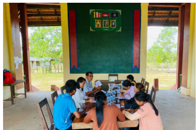
Researchers collecting baseline qualitative data for the Cambodia Nutrition Project (CNP), Stung Treng, March 2022

A brand-new project, Securing the Food Systems of Asian Mega-Deltas for Climate and Livelihood Resilience will address urgent concerns on climate change with its centres and development partners under the larger project, Asian Mega-Deltas: From Risk to Resilience . The initiative aims to create resilient, inclusive and productive deltas by removing systemic barriers to the scaling of transformative technologies and practices at community, national and regional levels. CDRI works with other partners to conduct research on Nutrition-Sensitive Deltaic Agrifood Systems to ensure that deltaic food systems sustain and enhance nutrition security equitably in a context of rapid change. The Agricultural Development Policy Assessment in Selected Mekong Subregion Countries aims to provide an overall picture of agricultural developments, review supporting policies for agricultural development in selected Mekong subregions (Vietnam, Cambodia and Lao PDR) and recommend solutions to develop the agricultural sector in the coming period. The final regional report was finished in April 2023.